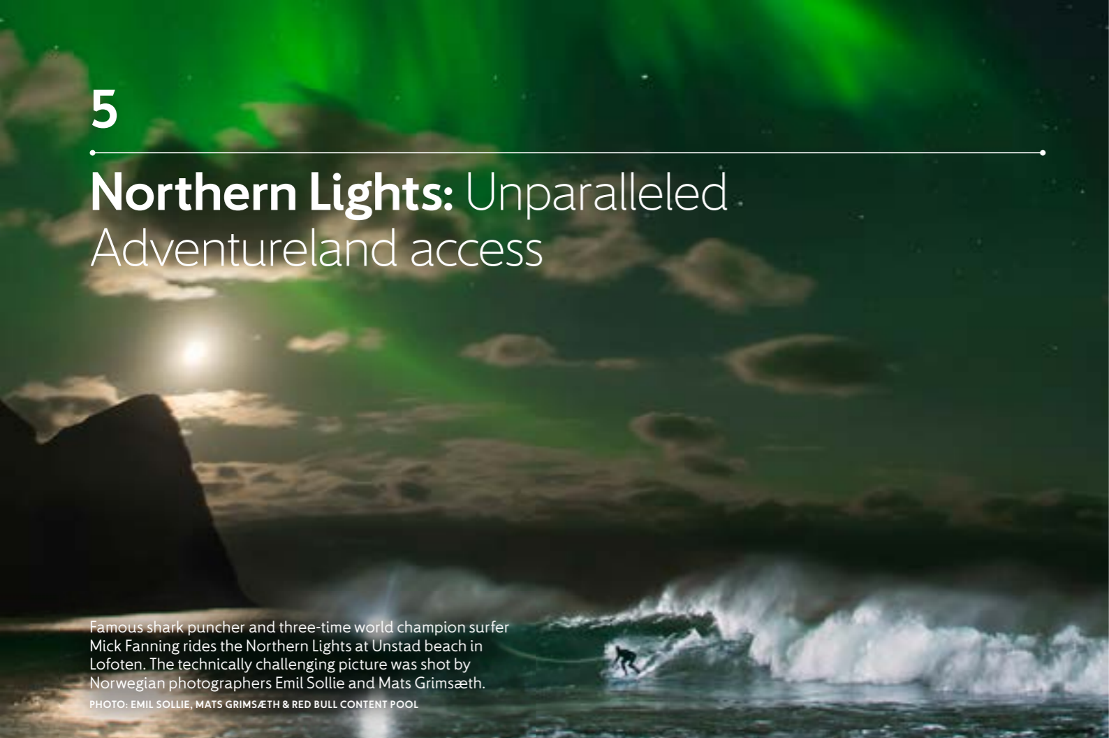
Famous shark puncher and three-time world champion surfer Mick Fanning rides the Northern Lights at Unstad beach in Lofoten. The technically challenging picture was shot by Norwegian photographers Emil Sollie and Mats Grimsæth.

Northern Norway offers the world's best access to the Northern Lights experience and a unique coastal culture in an unspoiled natural environment.